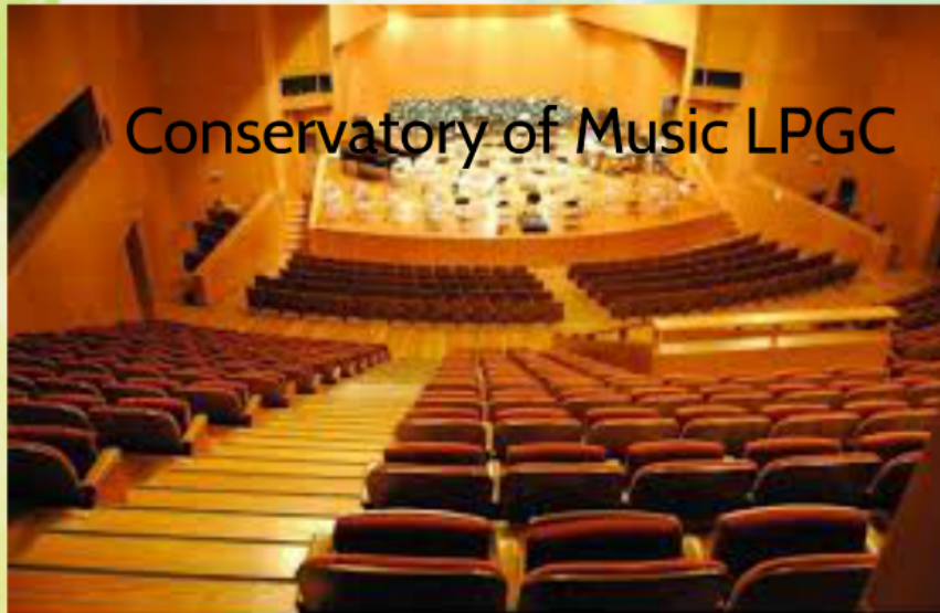
Conservatory of Music LPGC